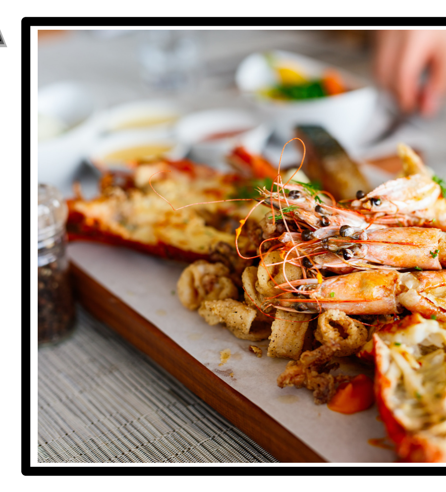
2399/-Half (2 persons)

CHICKEN MANCHURIAN CHICKEN CHILLI DRY EGG FRIED RICE CHICKEN CHOW MEIN FRIES SHAWARMA BREAD